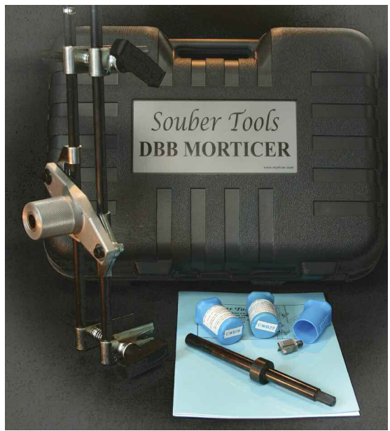
The complete Mortice Kit included in the price.